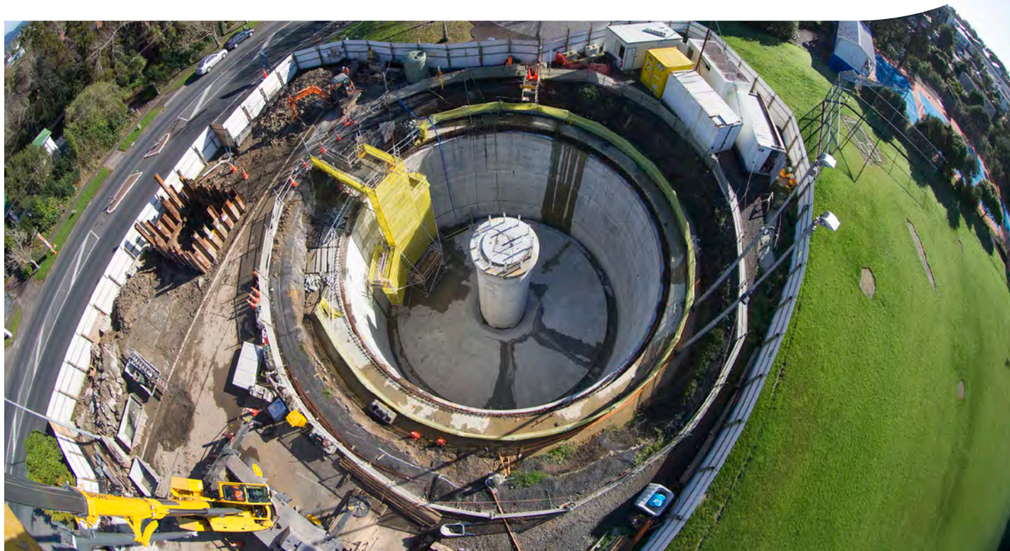
The concrete storage tank at Harold Moody Reserve.

Great progress continues to be made on the wastewater upgrades in Glen Eden. Despite the wet weather, construction hasn't slowed down with work progressing in Parris Park, Harold Moody Reserve and Ceramco Park.